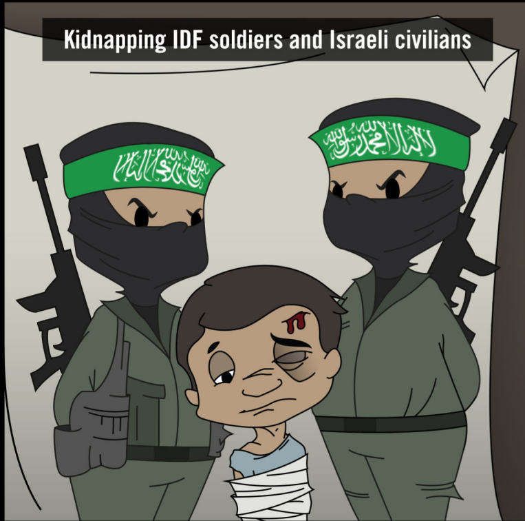
Kidnapping IDF soldiers and Israeli civilians