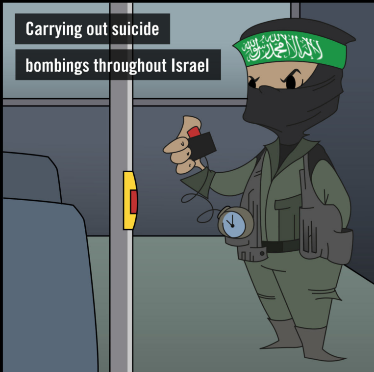
Carrying out suicide bombings throughout Israel