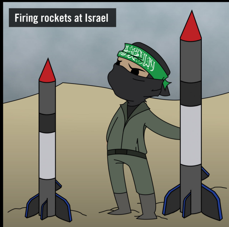
Firing rockets at Israel